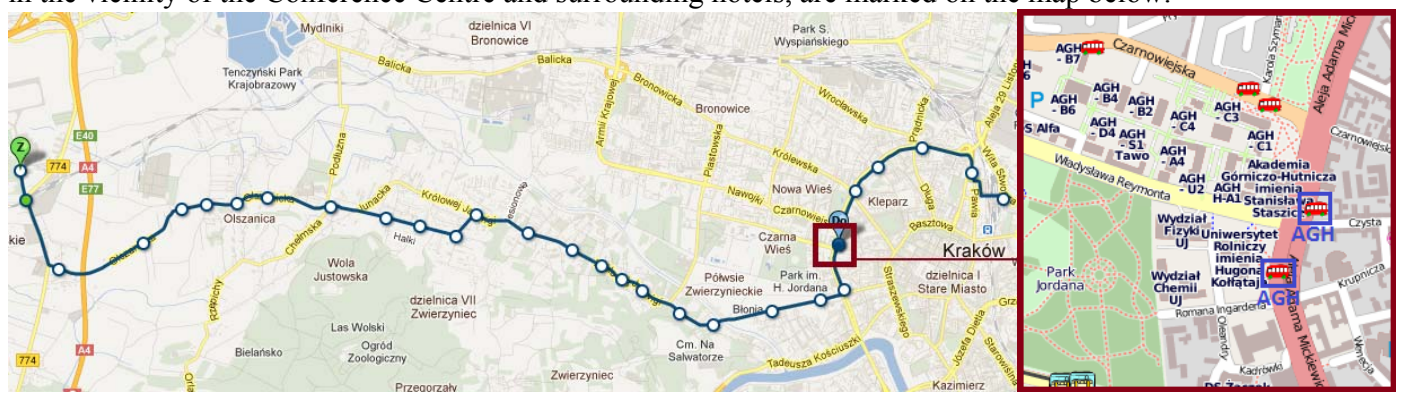
292 Bus (green color - bus stop Port Lotniczy (Airport), blue color - bus stop AGH)

The bus stop is located directly in front of the passenger terminal (on the right hand side). It takes approximately 40 minutes to go to the city center by bus. The fare is 3.20 PLN, and tickets on buses can be bought from the driver for 3.70 PLN (~1.0 EUR). You do not need to pay for luggage. Tickets can also be purchased at newspaper stands in the passenger terminal on your way out of the airport. Public bus numbers from the airport are: 292, 208 or the night bus 902. The time-tables of these buses are displayed below. It is recommended to have printed names of the chosen bus stops which should facilitate communication with the passengers or drivers. The recommended stop points, placed in the vicinity of the Conference Centre and surrounding hotels, are marked on the map below.